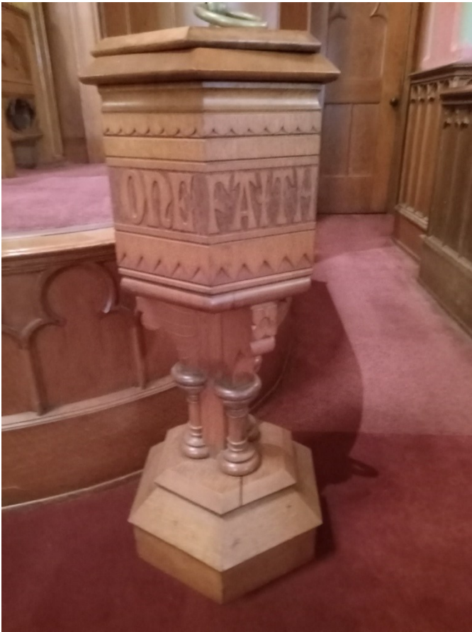
A few photos from our beautiful building.

Thank you for supporting your PMUC Community!